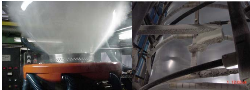
A system without the Evac Results after just a few days